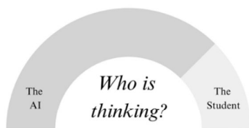
Figure 0.1 A semicircle shaded in a light and darker gray. Darker gray fills 75% of the semicircle and is labeled The AI ; 25% is lighter gray and is labeled The Student .