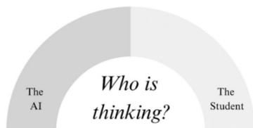
Figure 0.2 A semicircle shaded in a light and darker gray. Darker gray fills 50% of the semicircle and is labeled The AI ; 50% is lighter gray and is labeled The Student .